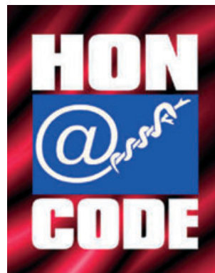
Figure 1 HONcode logo (reproduced with kind permission from HON Foundation).

The Health on the Net (HON) Foundation is an internationally recognized organization that aims to standardize the reliability of medical and health information available on the web [16]. In order to display the HONcode seal (Fig. 1), subscribing sites have to strictly adhere to eight HONcode principles. We looked for this