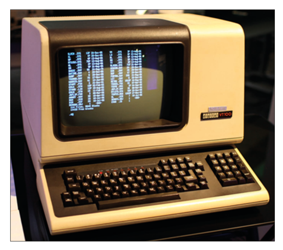
Fig. 1 A Digital Equipment Corporation (DEC) VT100 terminal.

Although EHR usability has improved considerably since the days of hard-wired, keyboard-based, VT100 terminals connected to a mainframe computer (see figure 1), very little has changed since the current mousebased, point and click, graphical user interfaces were introduced over the last 15 years. The lack of continued innovation in EHR interface design and the resulting "poor" EHR usability has only become a topic of widespread, national debate in the last 5 years [31]. Several reasons account for why this is a new concern. One, we are noticing it more substantially now as a reflection of the rapid increase in the number of new users, who are using overly complex systems, often with limited training or expertise [32]. Second, innovation in the human-computer interface, among many other facets of EHRs, has been stifled due to the rapidly changing Meaningful Use EHR certification criteria that have required EHR developers to make numerous changes to their system's user interfaces [33]. This has resulted in the dual disadvantages of increasing the complexity of these composite user interfaces while also reducing the number of people and the amount of time allocated to the