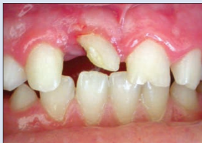
Figure 1: Clinical appearance of the right central incisor with crown fracture.