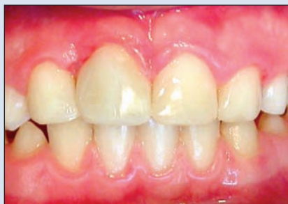
Figure 4: Final esthetic result after restoration and occlusal adjustment.