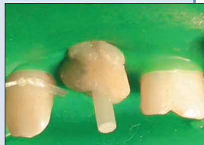
Figure 3: Intraoral view after restoration of the permanent maxillary right central incisor with a glass-fibre-reinforced composite post.