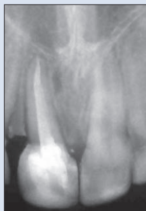
Figure 5: Follow-up periapical radiograph, one year after treatment.