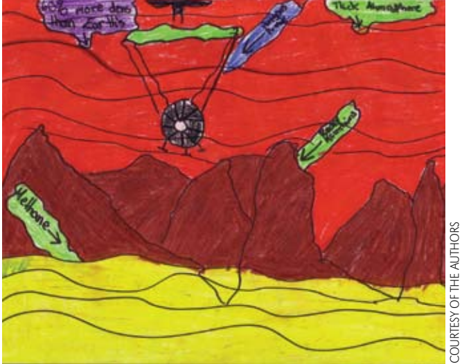
The Reading, Writing, and Rings! curriculum also provides opportunities for students to practice scientific illustration.

The Cassini Spacecraft was named after Jon Dominec [Jean Dominique Cassini]. The brown stripes on Saturn are clouds. Saturn is freezing. Saturn is huge like Jupiter. Saturn is enormous. The inner and outer rings are separated. Saturn has lots of storms. Saturn has a rocky area and a metallic hydrogen gas. Saturn's rings are out of lots of things. If somebody lives on Saturn they will die very quickly. Saturn has lots of things on it.