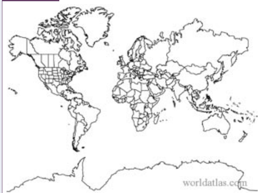
FIGURE 1 World Map