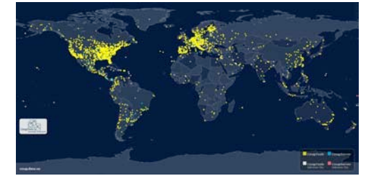
Figure 1. CmapTools users throughout the world.

Given its roots described above, it is not surprising that the most prevalent application of concept mapping is in facilitating meaningful learning. Figure 2 shows a graph of the number of downloads of CmapTools from the IHMC download Website (there are other means of obtaining the