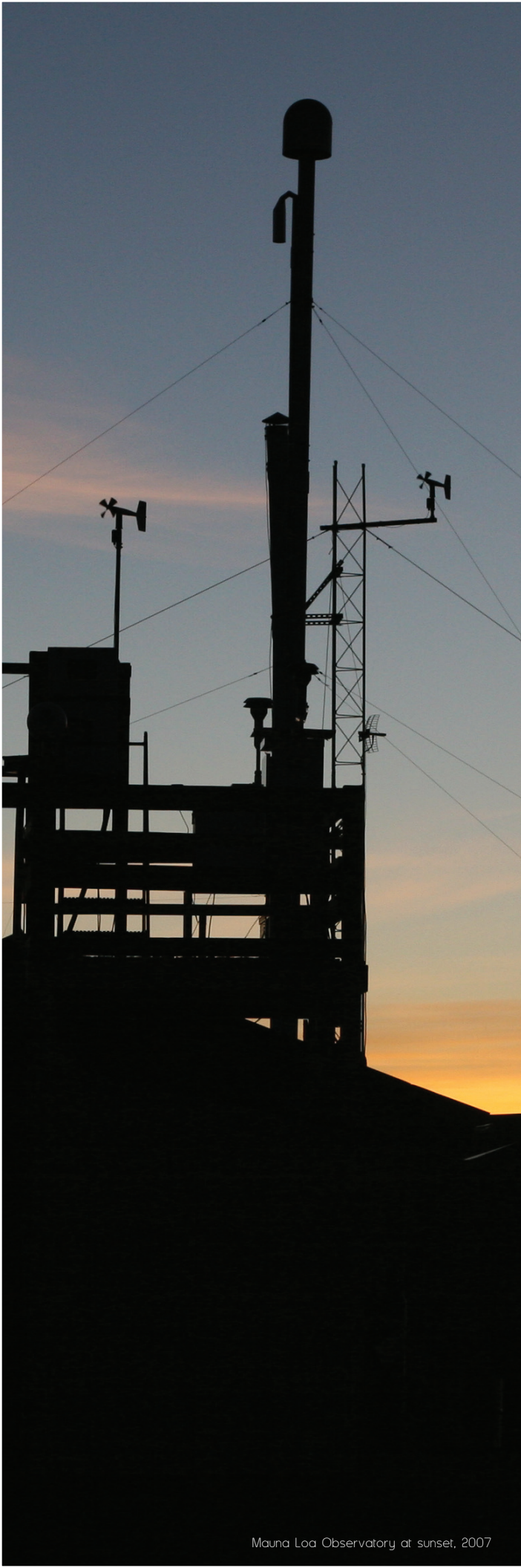
Mauna Loa Observatory at sunset, 2007