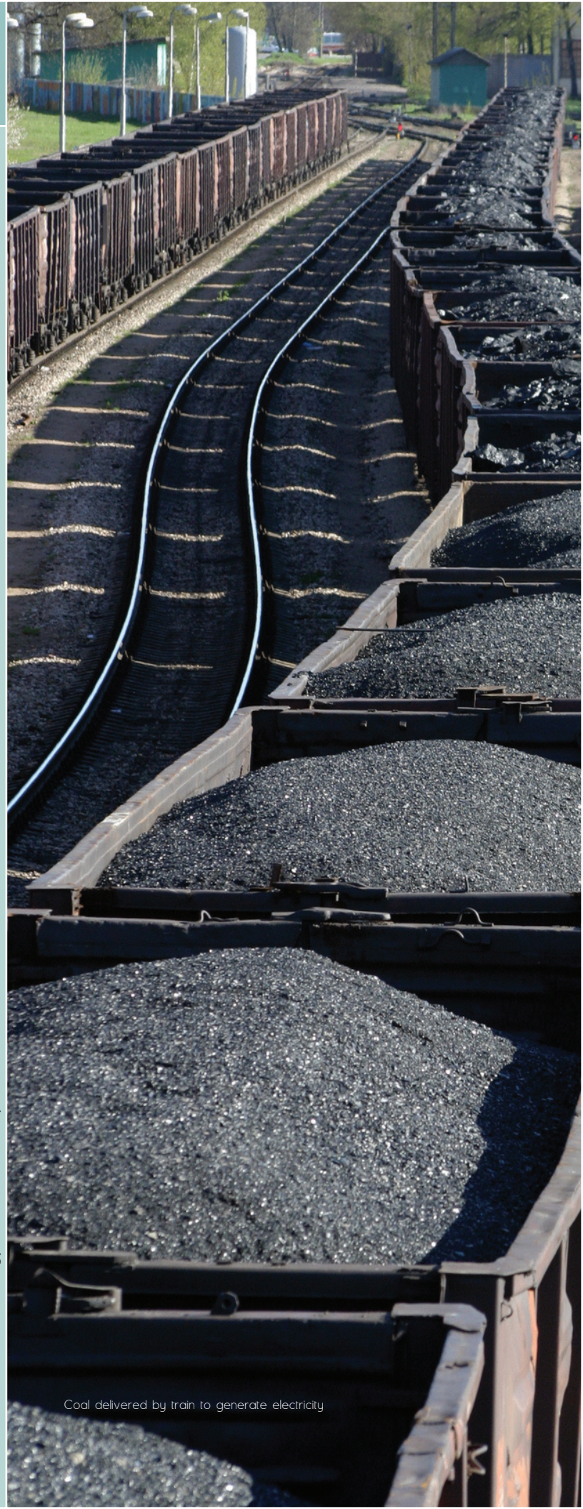
Coal delivered by train to generate electricity