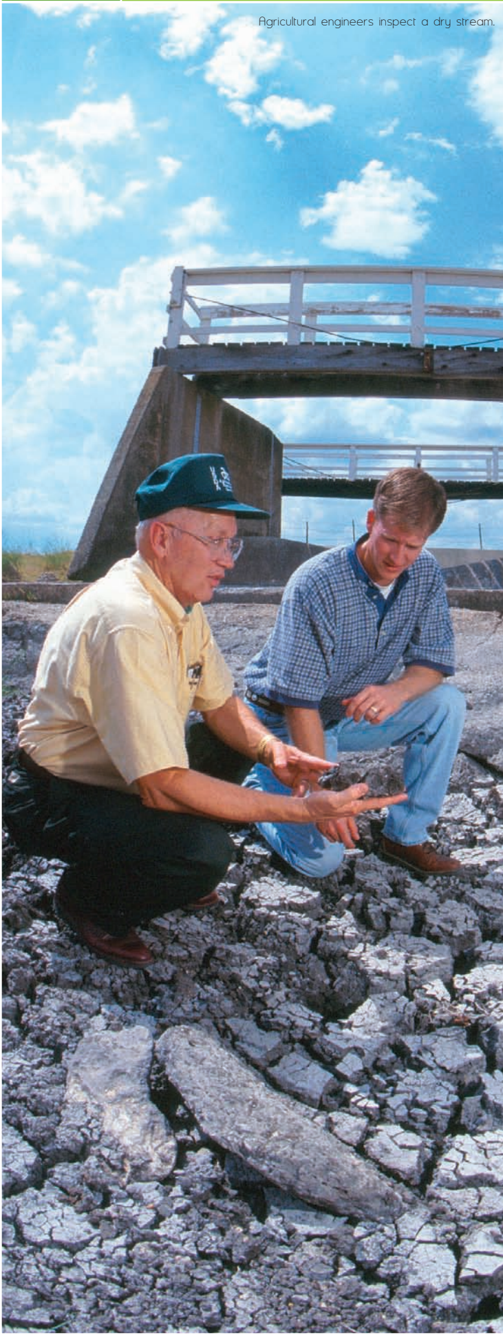
Agricultural engineers inspect a dry stream.