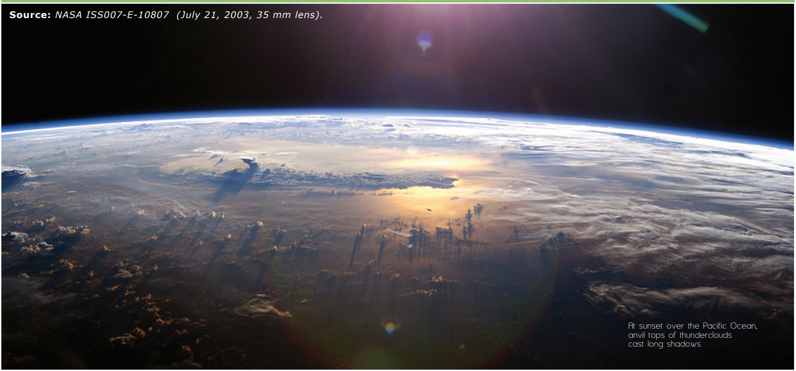
At sunset over the Pacific Ocean, anvil tops of thunderclouds cast long shadows